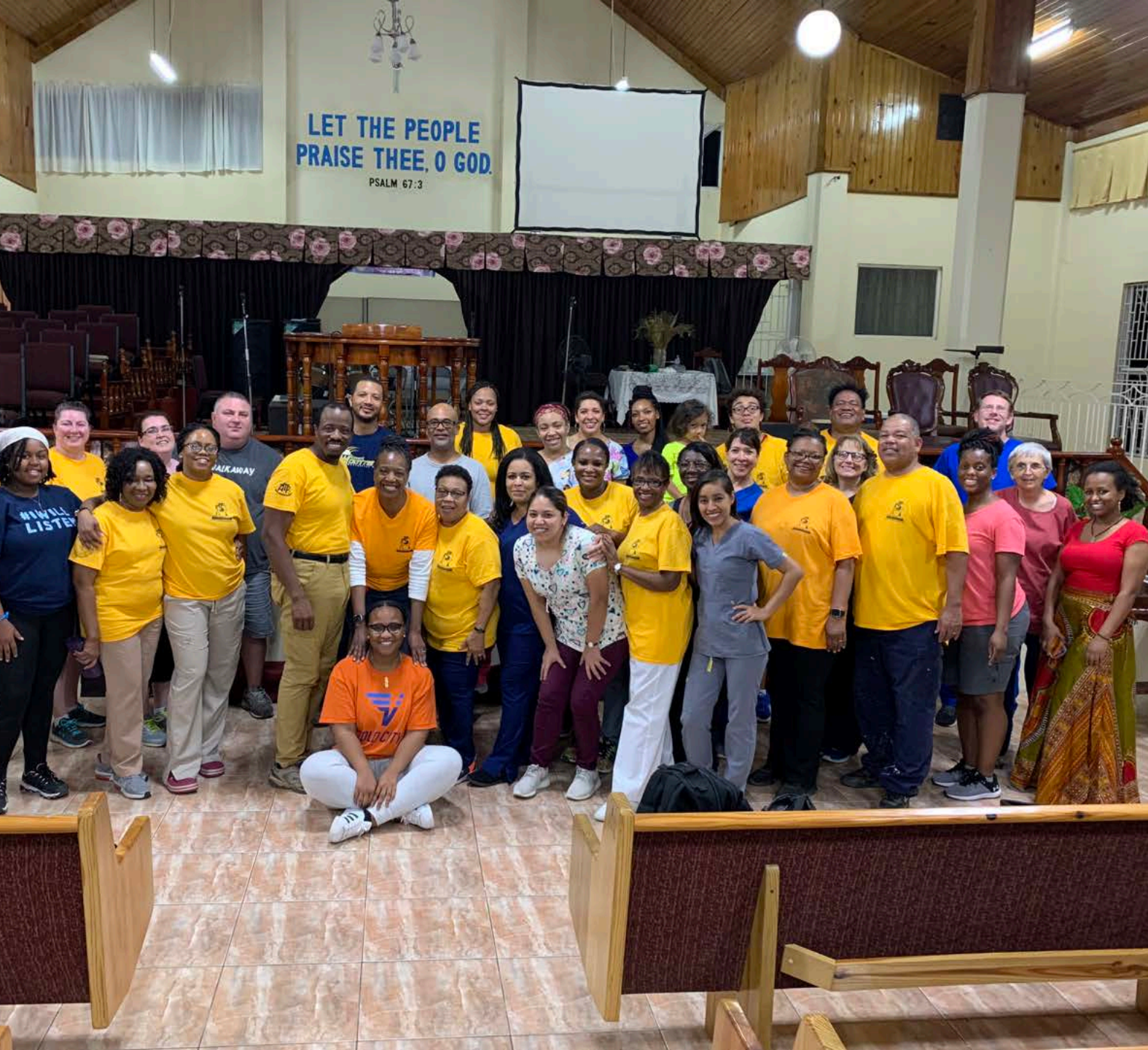
Medical Mission 2020 Team